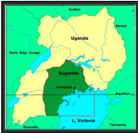
Figure 3 4 .