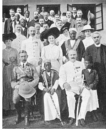
Figure 4 5 .

The Buganda Kingdom is today home to the Republic of Uganda's political and commercial capital city Kampala as well as the country's main International airport Entebbe (see fig.1). Uganda is made up of almost 40 different ethnic groups with the Baganda being the largest group at approximately 17% of the total population (CIA 2002 census). The early history of the Kingdom of Buganda has for generations been passed down through oral tradition and accounts on the formation of the kingdom vary depending on the source. For the purposes of this paper I have compiled information on the history of the Kingdom from texts from the early 20 th century written about the customs of the Baganda, more recent journal articles, as well as information from the official website of the Buganda Kingdom and related unofficial sites.