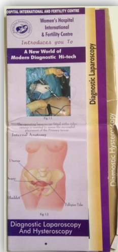
Figure 8 Clinic pamphlet

ing and go forward to undertake their quest for health with conviction (Davis-Floyd and Sargent 1997). The ontological politics I mention here just briefly but they are certainly worth further investigation in future studies especially as ARTs become available in rural areas where they will have to compete with more traditional views of healing including ethnomedicine and local frameworks therein. But my point here is that there are power dynamics at play in the private clinic setting that encourage the patient to have faith in these modern processes and perhaps to leave more traditional concerns at the door.